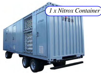
1 x Nitrox Container