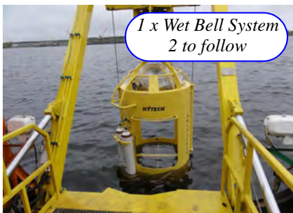
1 x Wet Bell System 2 to follow