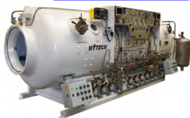
1 x Decompression Chamber