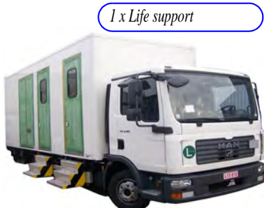
1 x Life support