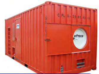
Container with Decompression Chamber

Hytech is awarded with a contract from a customer in Singapore, to design and manufacture complete a new life support system for an existing self propelled hyperbaric life boat for 18 divers, all under DNV class / certification.