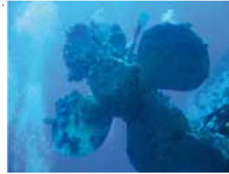
Inspection of propeller and rudder of a ship.

The SUBVIEW portable video system can simultaneously capture, visualize and store submerged activities with four waterproof cameras on a battery powered video system, integrated in a single rugged travel case. With the integrated battery unit the system can run stand-alone for hours, which makes it perfectly suitable for use in areas / situations where no direct power is available.