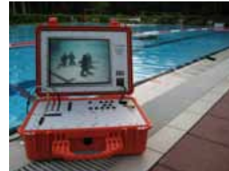
Observation of professional divers during training.